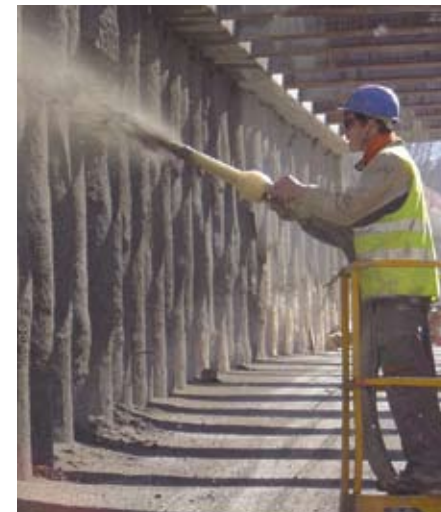
Fine concrete pumps like the P 715 are one of the most versatile of systems. You can use them for shotcrete ...