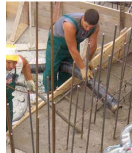
... or for pumping fine concrete of up to 16 mm. Because of the self-sealing and adjusting ring, you can even use them for liquid screed (right-hand picture).